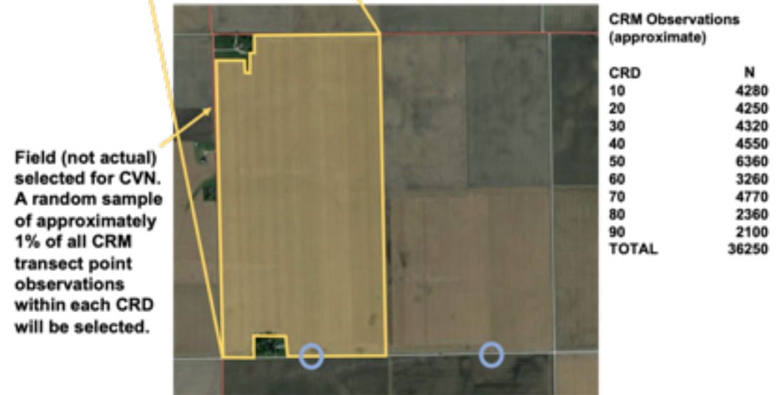
○ CRM Transect Point Observations. Approximately 36,250 across Indiana.